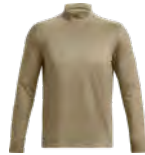
499 Federal Tan / Black